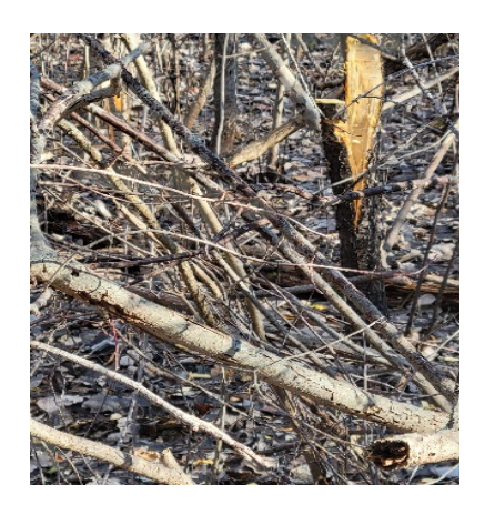
Interior of a Buckthorn Tree, Orange color was a surprise.